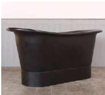
Triple Matte Black Bath