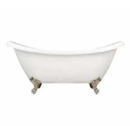
Double Ended White Slipper Bath