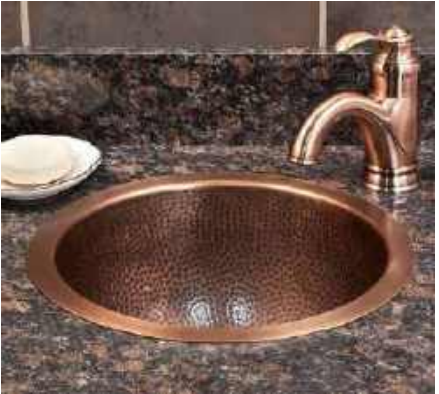
Copper Hammered Round Drop In Bowl