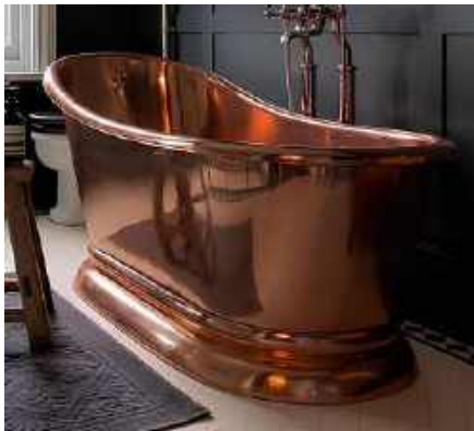
Double Ended Gloss Bath