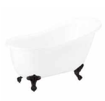
Osborne White Single Slipper Bath