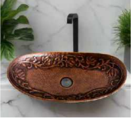
Floral Oval Copper Bathroom Trough