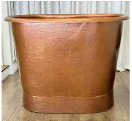
Antique Copper Hammered Oval Japanese Soaking Tub