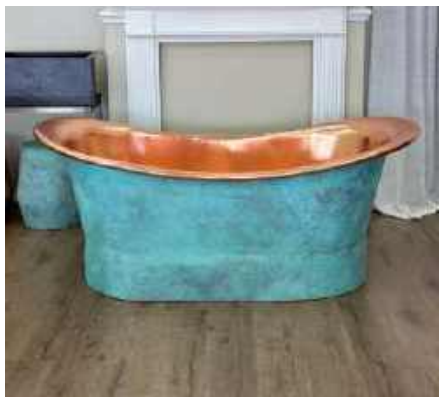
Verdigris Copper Bath