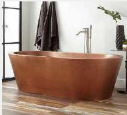
Double Flat Edged Hammered Bath