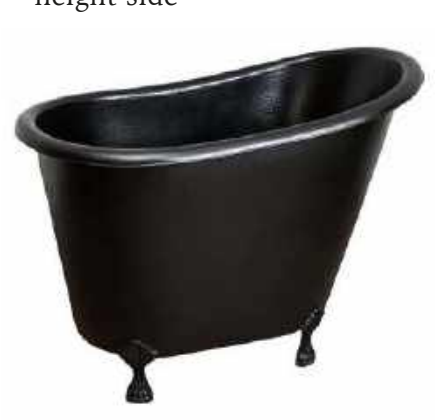
Matt Black Copper Hammered Japanese Soaking Claw Tub