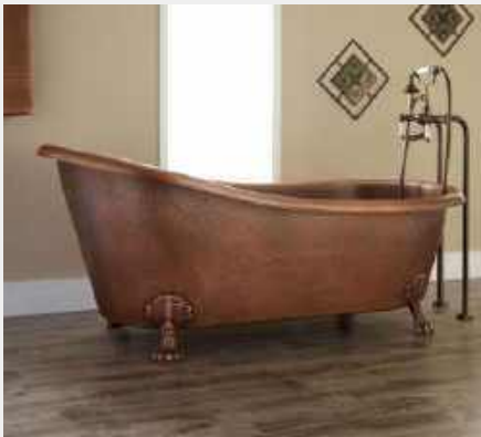
Hammered Clawfoot Single Slipper Bath