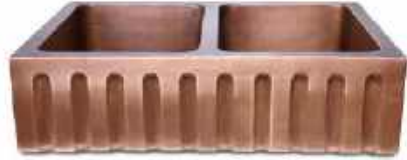
Copper Fluted Double Bowl Sink