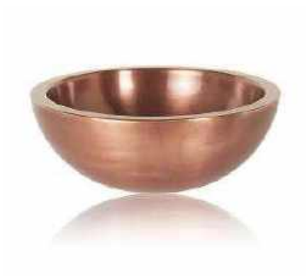
Copper Round Plain Bowl