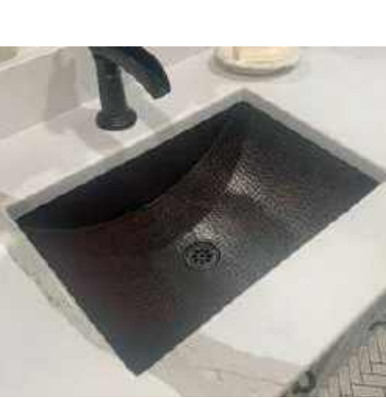
Copper Hammered Rectangular Trough