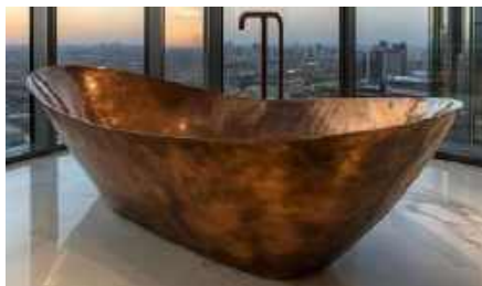
Handcrafted Antique Plain Copper Bath