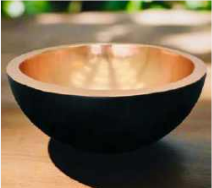
Matt Black Round Copper Bowl