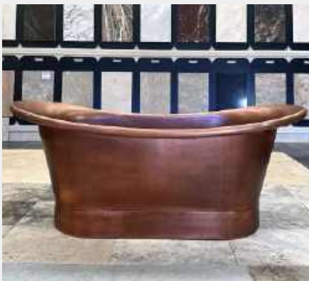
Light Antique Plain Copper Bath