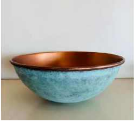
Rustic Verdigris Copper Bowl