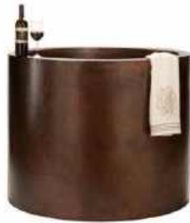
Dark Hammered Copper Japanese Soaking Tub