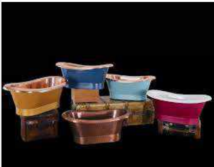
Pure Copper Baby Baths