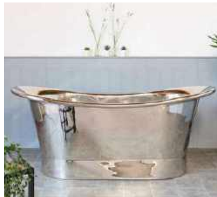
Copper Polished Nickel Bath