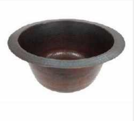
Copper Round Bathroom Bowl