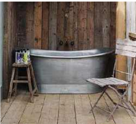
Copper Nickel Industrial Bath