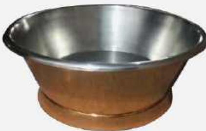
Polished Copper Internal Tin Round Bath