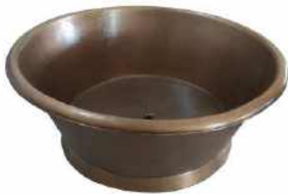
Antique Copper Hammered Round Bath