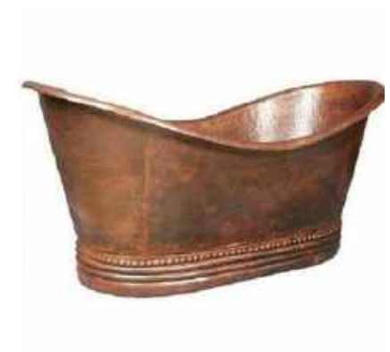
Mexican Fire Double Bath