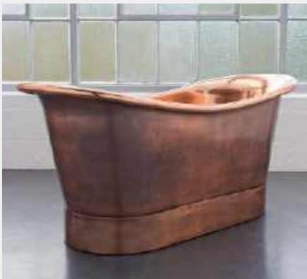
Ancient Copper Bath