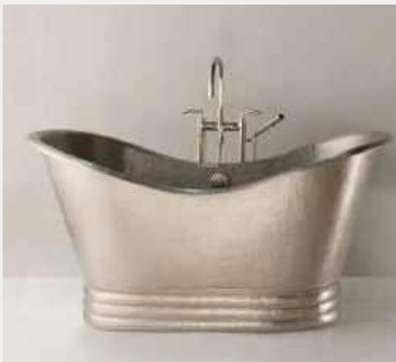
Copper Polished Nickel Bath Hammered