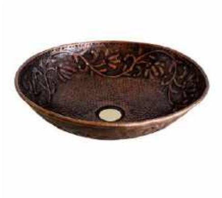
Floral Round Copper Bowl