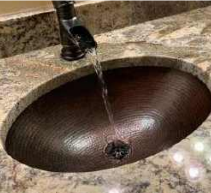
Copper Hammered Oval Bathroom Sink