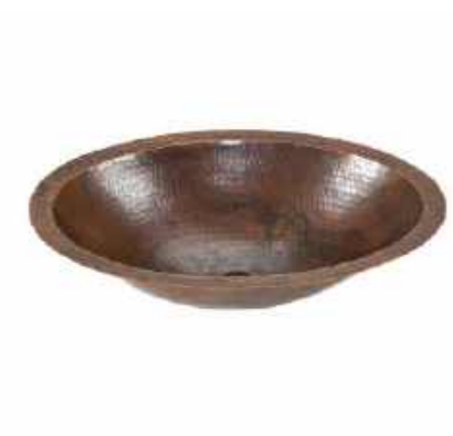
Copper Hammered Oval Bathroom Sink