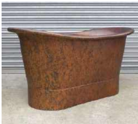
Rustic Copper Bath