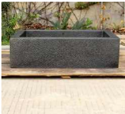
Copper Farmhouse Sink Large Black Hammered