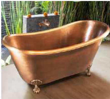
Hammered Double Slipper Claw Bath