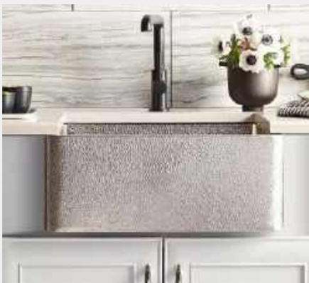
Copper Farmhouse Sink Large Brushed Nickel