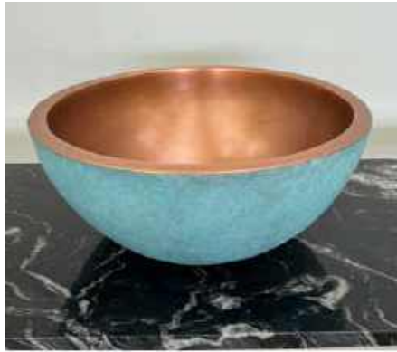
Verdigris Copper Round Bowl