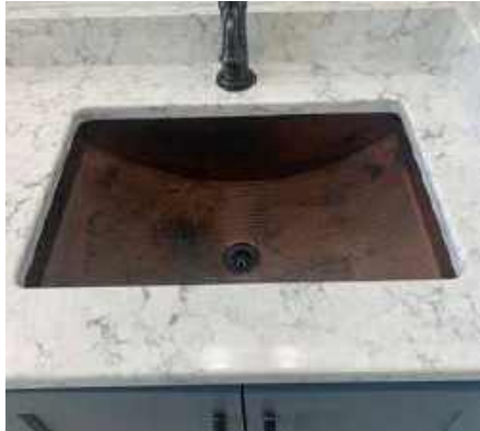
Copper Mexican Fire Rectangular Trough