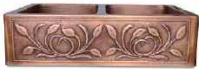
Copper Petal Front Double Bowl Farmhouse Sink