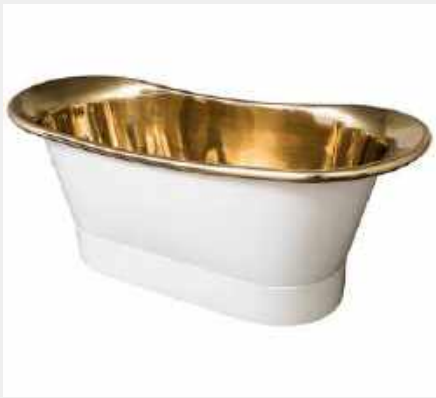
White Brass Bath