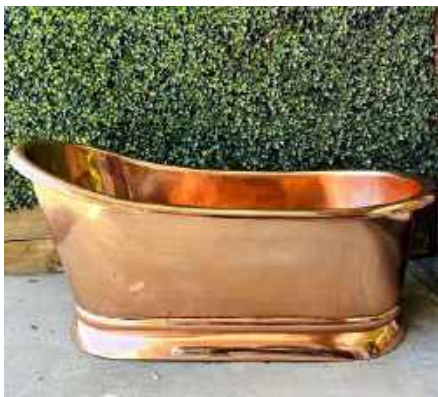
Shiny Polished Single Slipper Bath