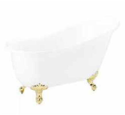
Piarra White Single Slipper Bath