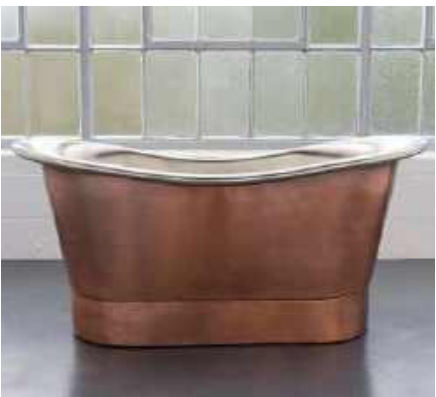
Antique Copper Polished Nickel Bath