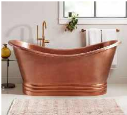
Antique Copper Double Ended Bath