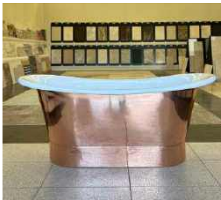
Snow White Interior Copper Bath