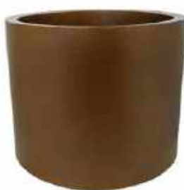
Mocha Copper Hammered Japanese Soaking Tub