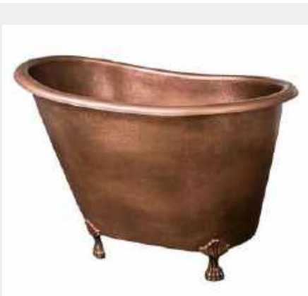
Antique Copper Hammered Japanese Soaking Claw Tub