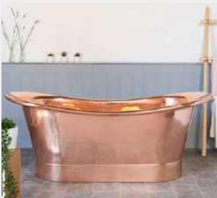
Copper Shiny Polished Bath