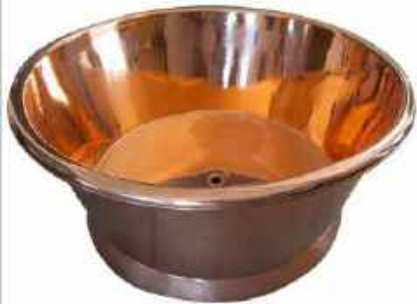
Copper Shiny Round Polished Bath