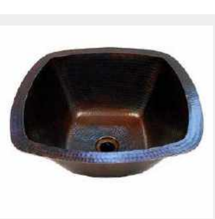
Copper Hammered Square Bathroom Sink