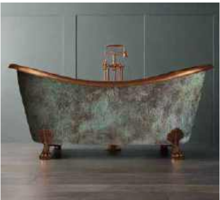
Verdigris Double Slipper Claw Bath