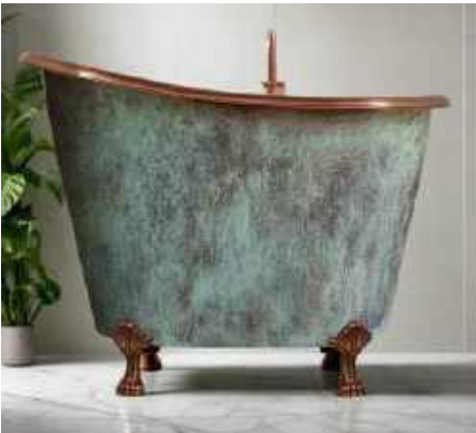
Verdigris Japanese Soaking Copper Claw Tub