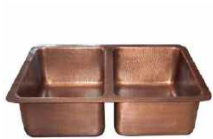
Copper Hammered Double Drop In Sink