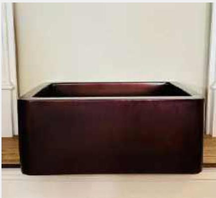
Dark Ancient Copper Farmhouse Sink Small