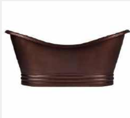
Dark Hammered Double Bath