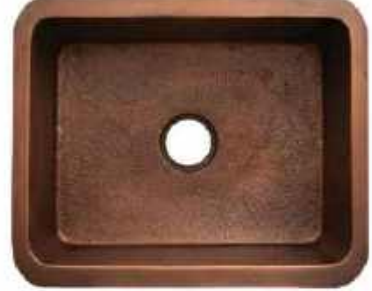
Hammered Copper Drop In Sink Small