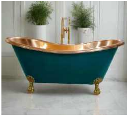
Butler Blue Clawfoot Bath