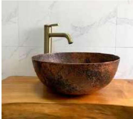
Mexican Copper Round Bowl