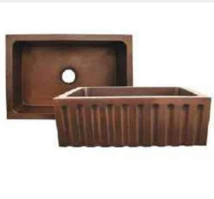
Copper Fluted Large Sink