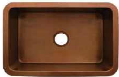
Copper Rectangular Drop In Sink Large