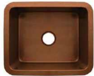
Copper Drop In Sink Small