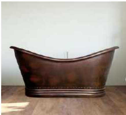
Mexican Fire Aged Double Bath