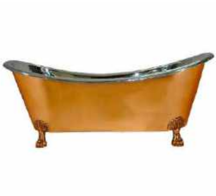
Copper Claw Internal Nickel