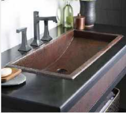
Copper Bathroom Trough Large