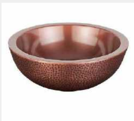
Copper Round Hammered Bowl