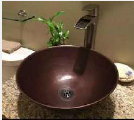
Copper Hammered Top Mount Bowl

our Copper Bathroom Bowls bring handcrafted beauty to modern bathroom spaces. Each bowl is shaped from solid copper and finished by hand, with intricate hammering and subtle detailing that add character and charm. The rich Antique Copper finish radiates warmth and sophistication, while the natural patina that develops over time enhances the bowl’s unique personality.