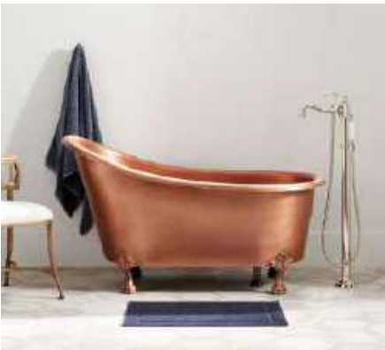
Classic Clawfoot Single Slipper Bath