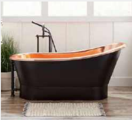
Matt Black Single Slipper Bath