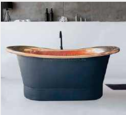
Matt Black Copper Bath