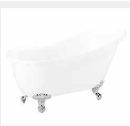
Wembley White Single Slipper Bath