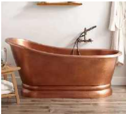
Antique Hammered Single Slipper Bath