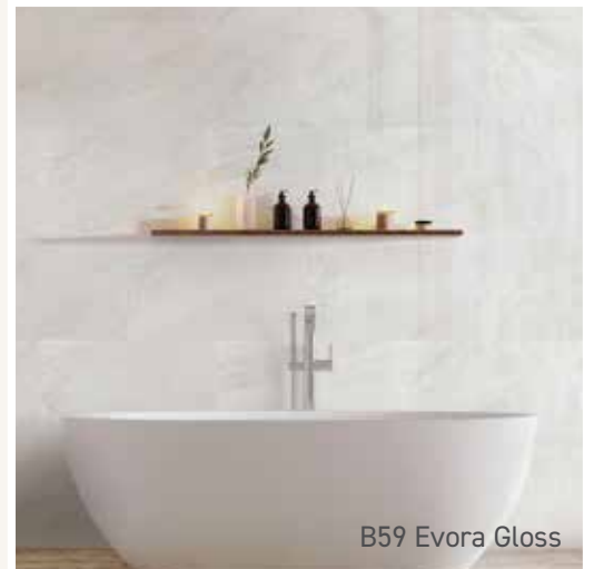
B59 Evora Gloss