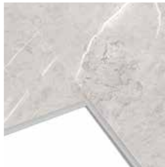
B07 Siracusa 65 x 37.5 cm