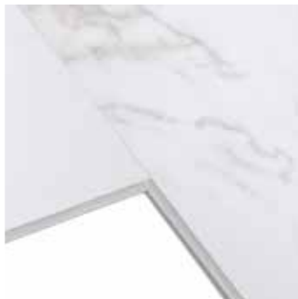
A93 Corleone 65 x 37.5 cm