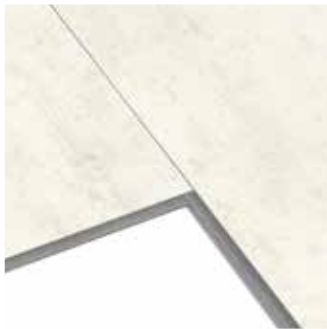
868 Light Cement 65 x 37.5 cm