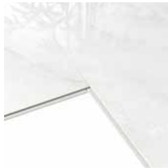
B59 Evora GLOSS 65 x 37.5 cm