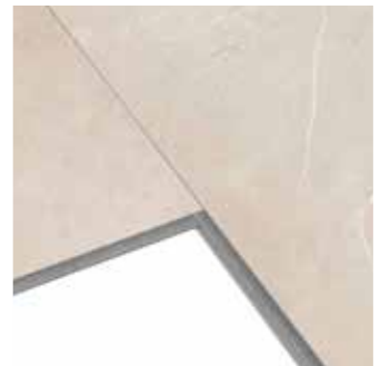
A53 Salina 65 x 37.5 cm