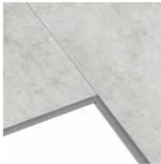
911 Chicago 65 x 37.5 cm