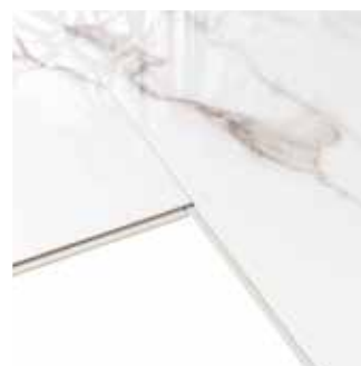
B29 Trapani GLOSS 65 x 37.5 cm