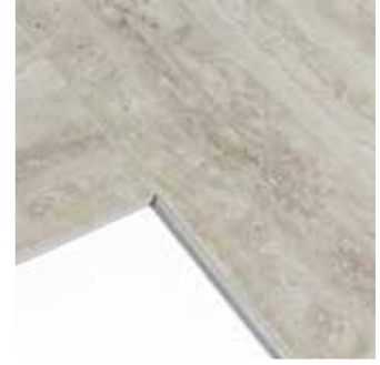
C42 Travertino 65 x 37.5 cm